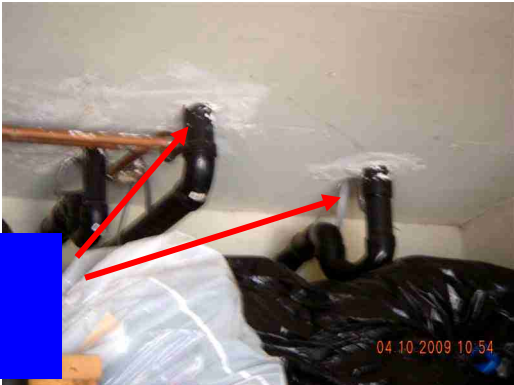
Plastic waste pipes passing through garage fire-rated ceiling finish