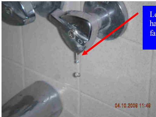
Leak at upper level hall shower cold water faucet