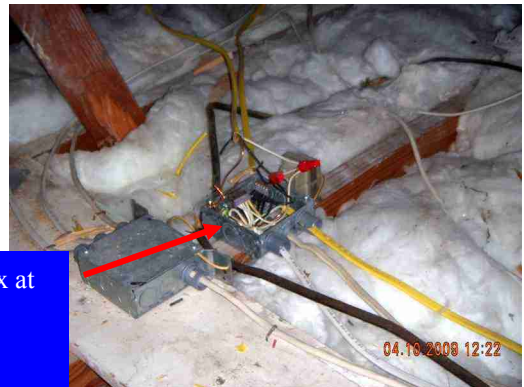
Open electrical box at attic