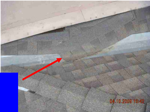
Loose shingles at valley