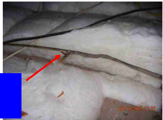
Electrical splice at attic