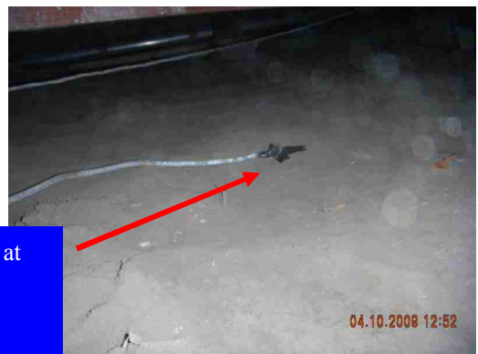
Abandoned wiring at crawl space