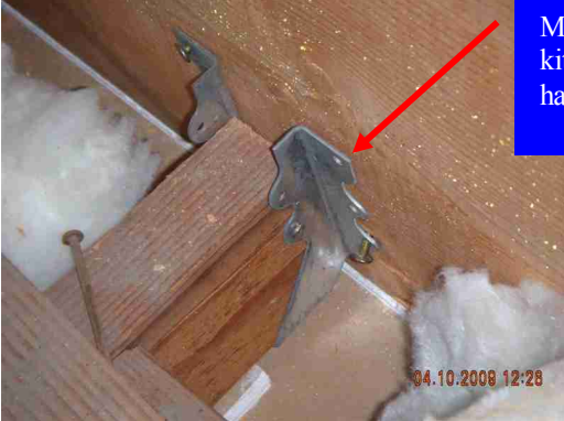
Missing nails at kitchen ceiling joist hangers