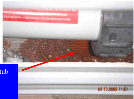
Leak at whirlpool tub jet plumbing