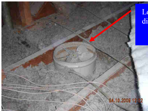
Lower bathroom fans discharge to the attic