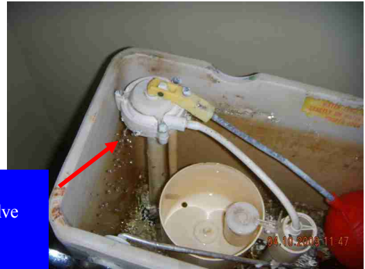
Leak at upper hall toilet tank filler valve