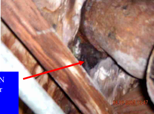
Dark damp area at N bath toilet sub-floor