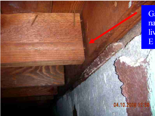
Gaps with exposed nails noted at the living room floor joist E end connections