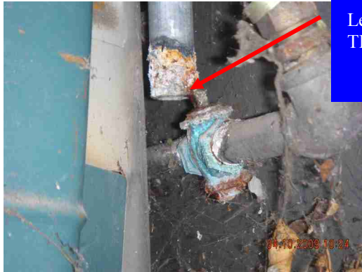
Leak at water heater TPR discharge pipe