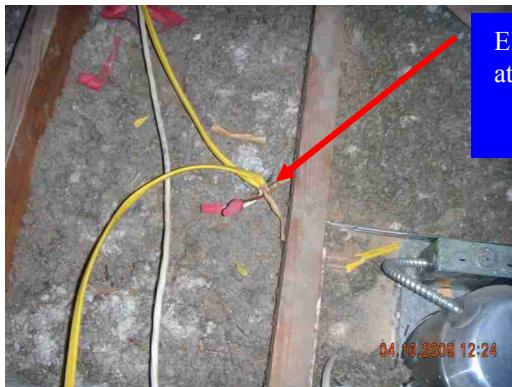
Electrical splice at attic