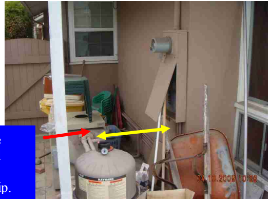
Insufficient service clearance provided between electrical panels & pool equip.