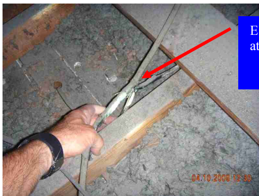
Electrical splice at attic