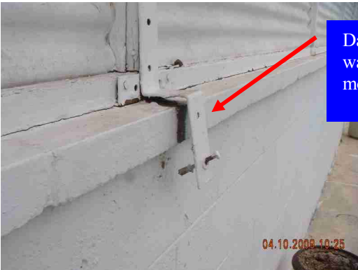
Damaged property wall privacy fence mount