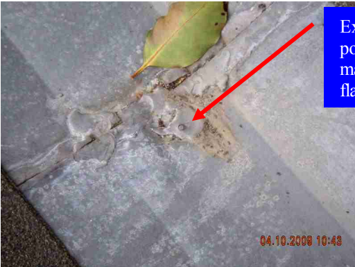
Exposed nail is popping through mastic at valley flashing